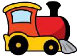
Toy Train £23