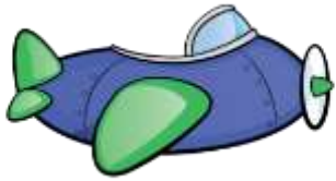
Toy Aeroplane £12